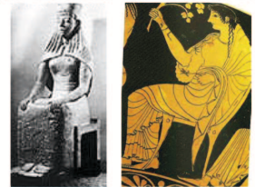
750 BC Prusias Acropolis Figure Goddess Hestia in Pottery Image