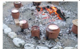
Experiment is Minoan Cooking

Bronze Age Origin of Western Traditions of Hearth & Home