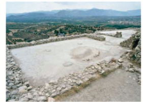
Mycenae Great Hall Excavation