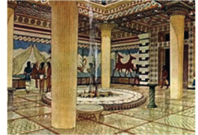
Mycenae Great Hall Reconstruction