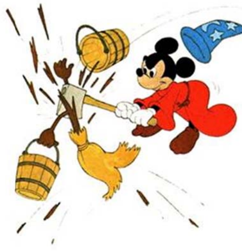
The Sorcerer's Apprentice driven mad!

The default choice is (a), and there is no present mechanism for or likelihood of (b). In our economy money grows in proportion to money and real wealth in proportion to our resourcefulness with the earth. It appears that successful economies necessarily end their own self-investment growth cycles as a precaution . It appears to create resources for other things while avoiding the, rather than submit to pressures conflicts